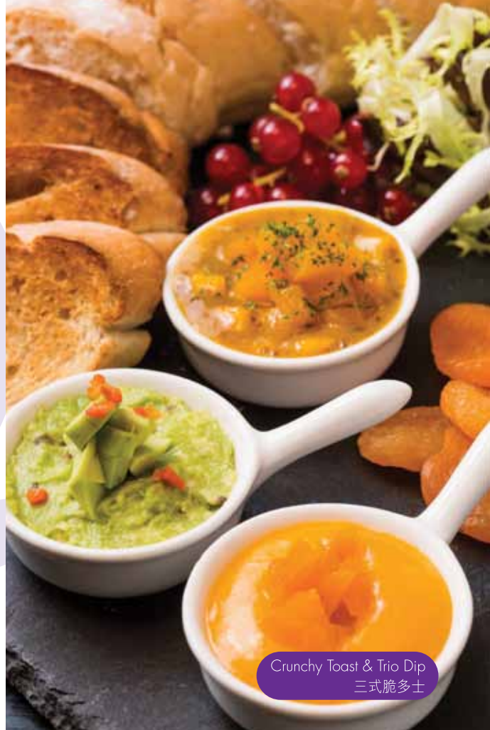
Crunchy Toast & Trio Dip 三式脆多士

Crunchy Toast & Trio Dip Trio toast served with mango mustard, hummus, apricot dip 三式脆多士 香脆多士伴芒果芥末, 豆蓉醬, 杏桃醬 HK$48