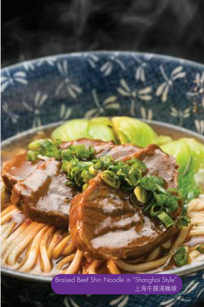
Braised Beef Shin Noodle in "Shanghai Style" 上海牛腩湯麵線