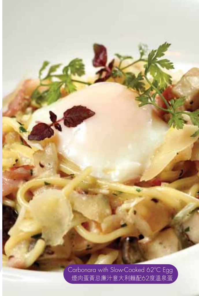
Carbonara with Slow-Cooked 62°C Egg 煙肉蛋黃忌廉汁意大利麵配62度溫泉蛋