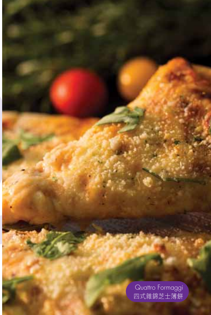
Quattro Formaggi 四式雜錦芝士薄餅