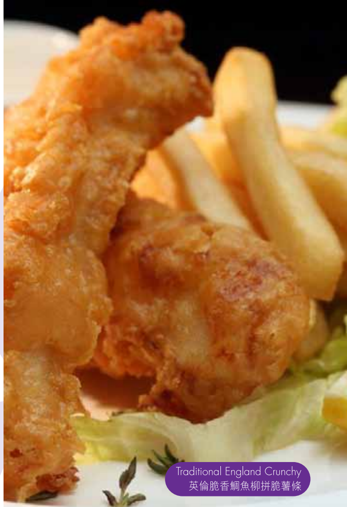
Traditional England Crunchy 英倫脆香鯛魚柳拼脆薯條