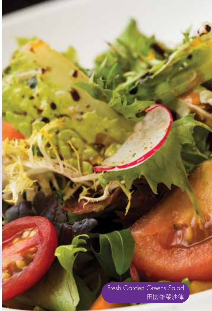
Fresh Garden Greens Salad 田園雜菜沙律